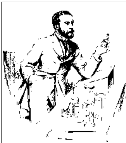
Pharmacologist Thomas Fraser collaborated with his University of Edinburgh colleague, chemist Alexander Crum Brown, on early studies of the relationship between chemical structure and pharmacological activity.

In their first experiments on the subject, they studied the pharmacological activity of six alkaloids, as well as their methylated derivatives. They found that upon methylation the ability of these alkaloids (e.g., strychnine) to produce convulsions disappeared. The narcotic properties of morphine and codeine were also diminished. At the same time, the methylated compounds exhibited a very different toxic effect, although gener-